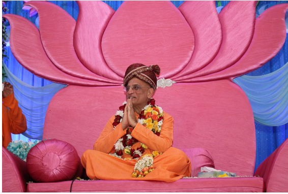
The lotus feet of our beloved spiritual master during the foot bathing ceremony.